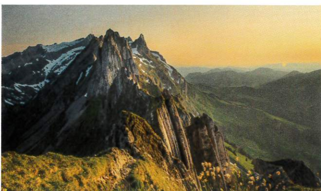
Schafli Ridge, Switzerland

The huge, jagged rocks with the pink and orange glow of the setting sun bouncing off the textured landscape were awe-inspiring. They were able to sit on a ledge and soak it all in as they captured God’s beauty through their cameras.