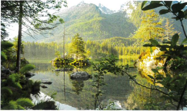
Hintersee Lake, Germany

Although there were many special moments they experienced together, one highlight was near a gorgeous lake in Hintersee, Germany.