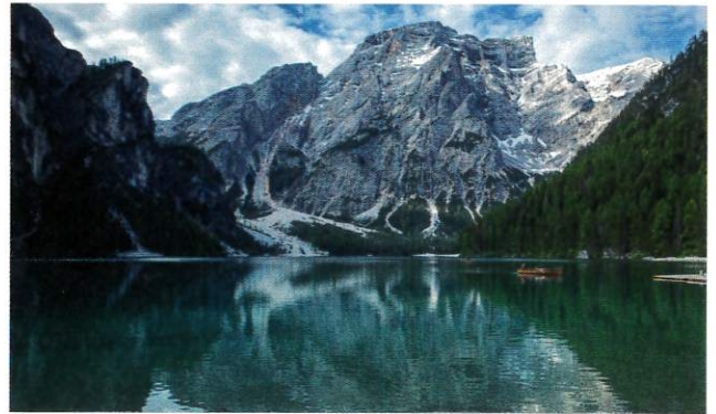
Lago di Braies, Italy